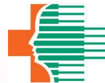
The First Affiliated Hospital, Shihezi University