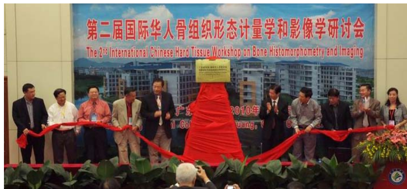
Fig. 9. Opening of “Joint Research Center on Anti-Osteoporosis Innovative Drugs of Guangdong Medical College and ICHTS

An opening ceremony the a ICHTS Collaborating Center “Joint Research Center on Anti-Osteoporosis Innovative Drugs of Guangdong Medical College and ICHTS” was held on October 26, 2010 at the opening of the 2010 ICHTS Bone Imaging Workshop at the Guangdong Medical College in Dongguan, Guangdong, China (Fig. 9).